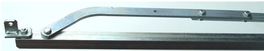
Arms shown configured for RH leaf to close first (when viewed from inside)