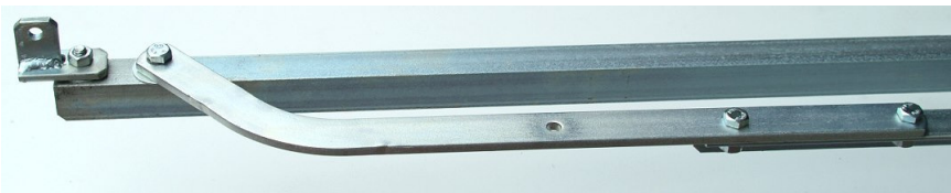
Arms shown configured for LH leaf to close first (when viewed from inside)